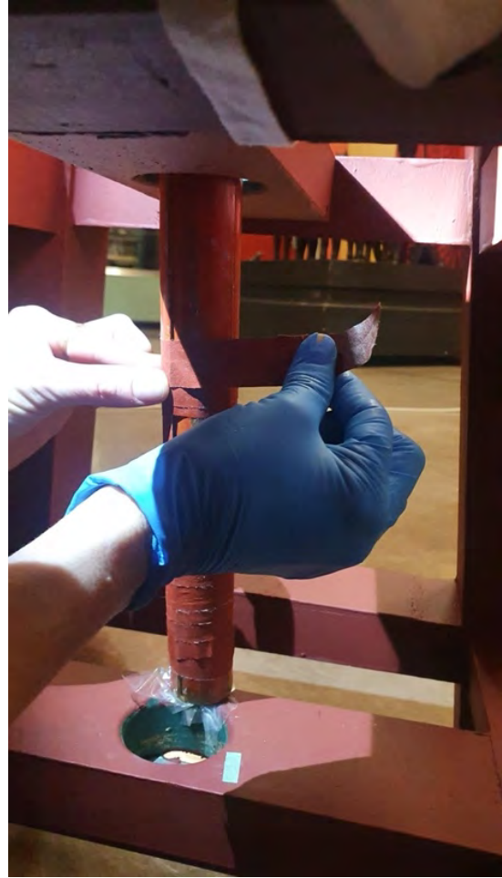
Images (l to r): Strips of hand-painted Japanese paper adhered with fish glue and wrapped around the pole.