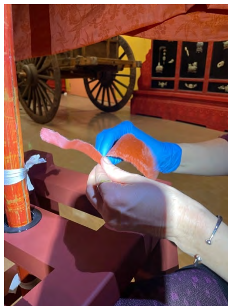
Images (l to r): Fish glue is inserted into wide cracks, and then hand-painted Japanese paper is prepared.