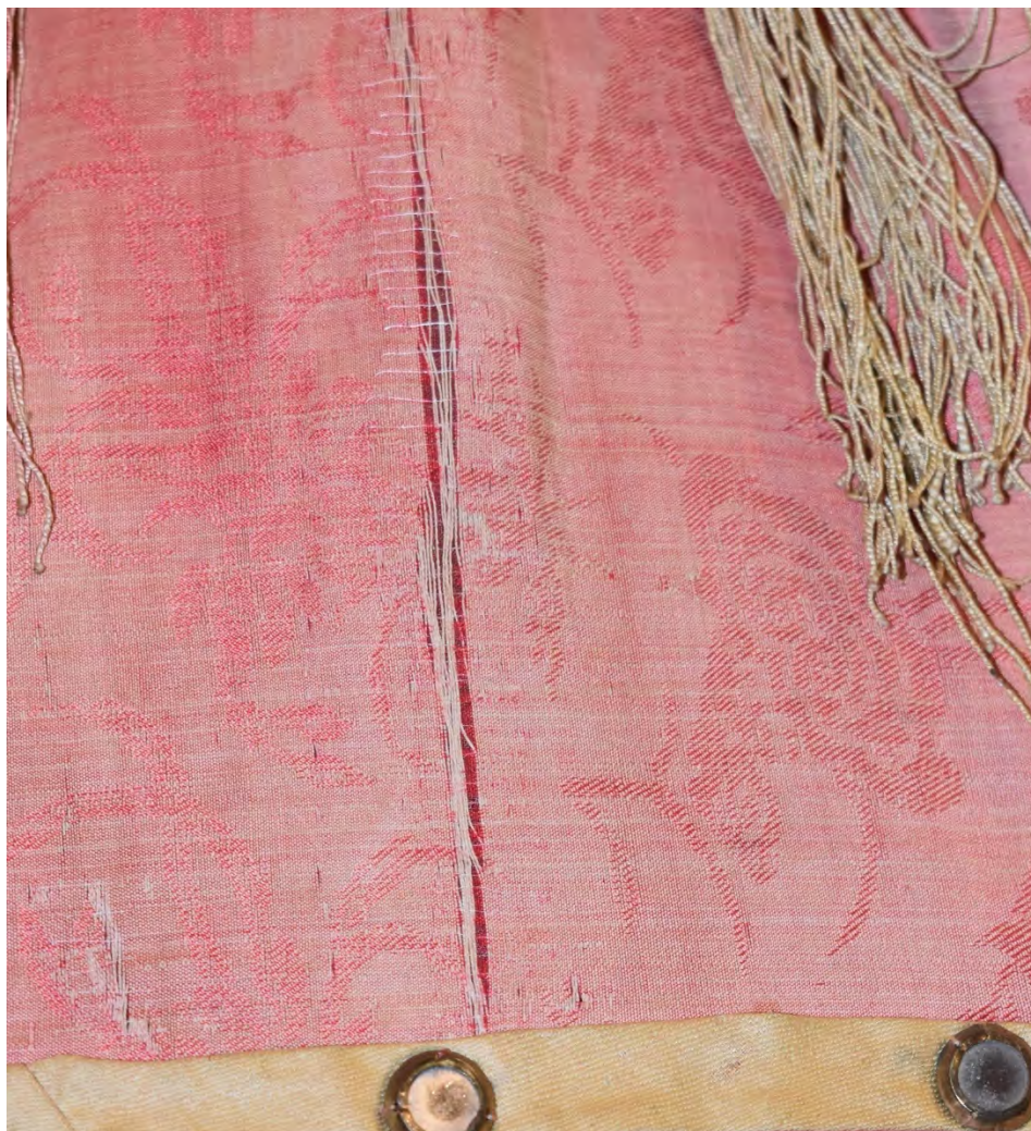
Image: Split fabric in the process of being stitched.