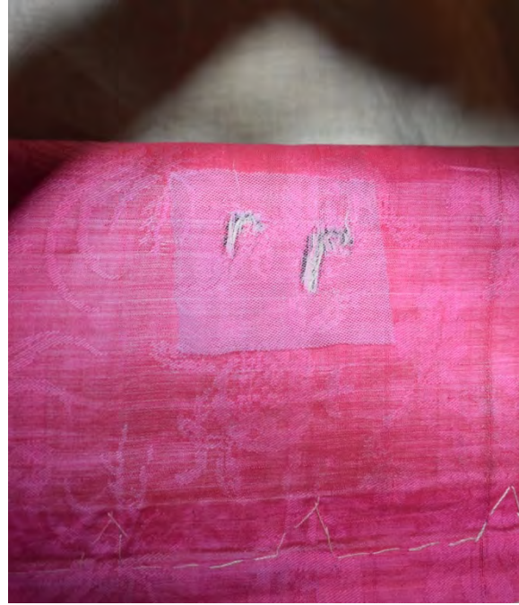
Image (l to r): Holes in skirt; nylon net patch on the inner surface.