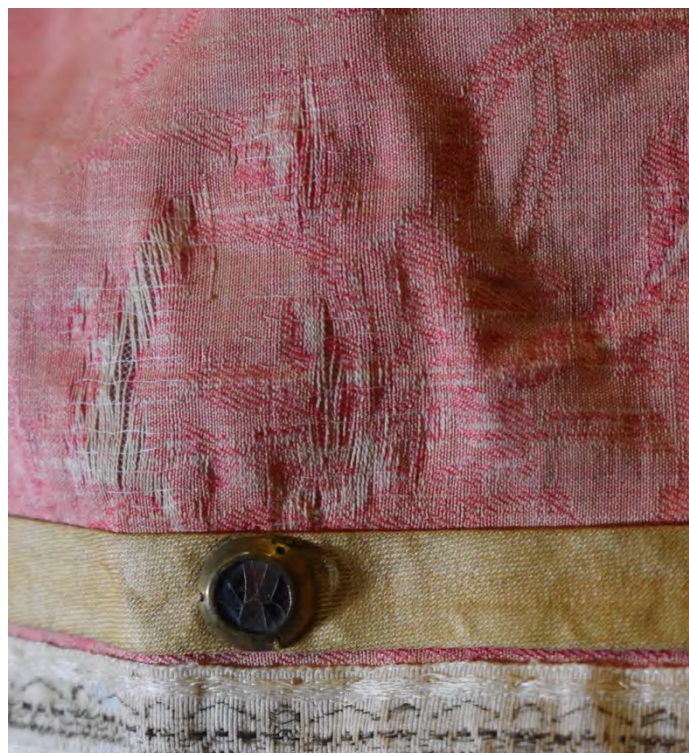
Image: Couching stitch using fine silk filament threads.