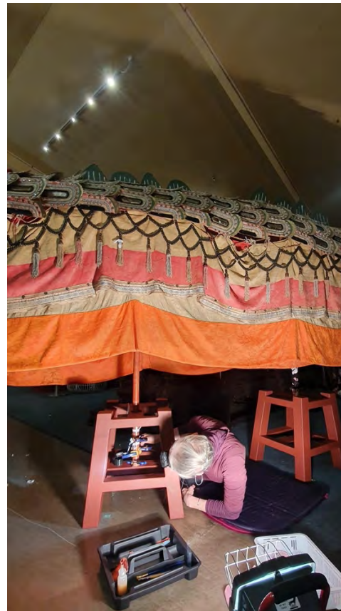
Images: The bamboo poles are clamped and left to dry.