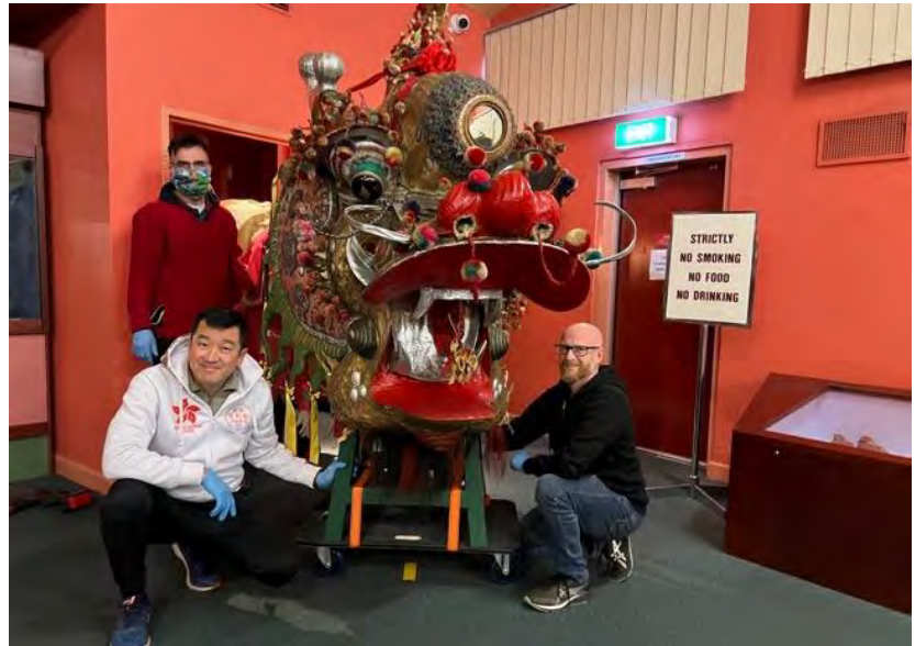
Image: Members of the Bendigo Chinese Association in the process of moving Loong.