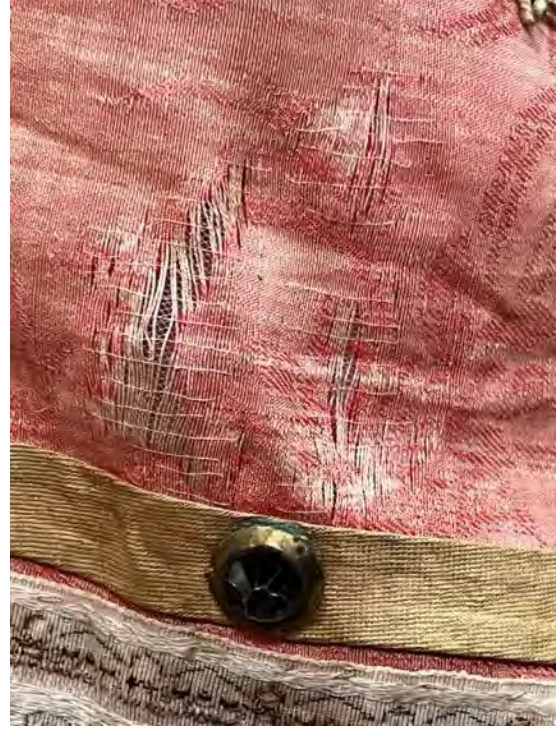
Images (l to r): Detailed images of the same area of stitch repairs from two different angles. The stitching is so fine it is almost transparent.