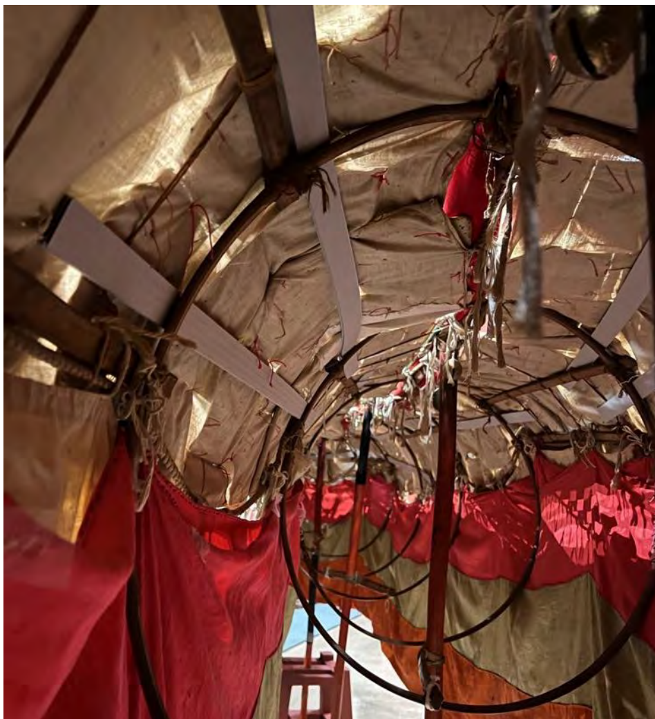
Image: Inside Loong 龍 archival board strips supporting the weight of the scales.