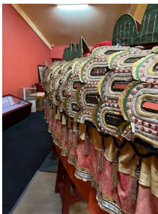
Image (l to r): Scale sagging before, and after inserting archival supports.