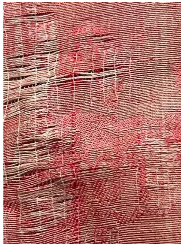
Images (top to bottom): Detailed images of the stitch repairs to the same area of the skirt