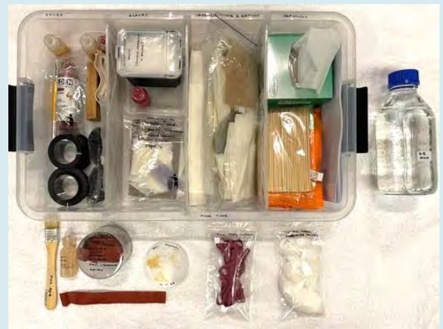
Image: The conservation kit prepared by the Grimwade team to be left in the Museum for staff and volunteers to use when making small repairs to Loong 龍.

They also prepared a small conservation kit for the Golden Dragon Museum to use on Loong 龍 in the future.